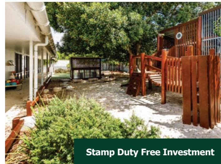
Stamp Duty Free Investment