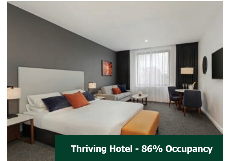
Thriving Hotel - 86% Occupancy