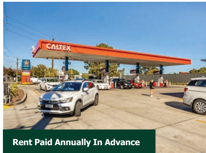
Rent Paid Annually In Advance