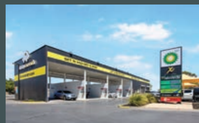
Pit Stop Car Wash Gawler East SA Page 26