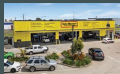
Auto Masters Garbutt QLD Page 47