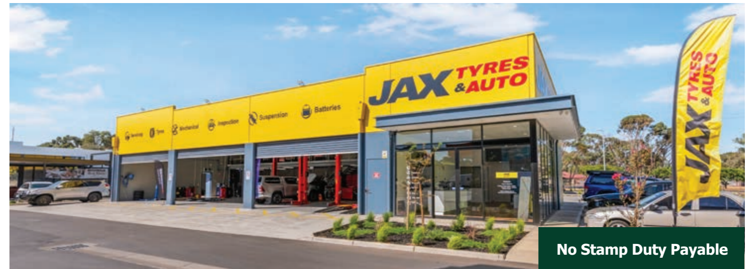
No Stamp Duty Payable