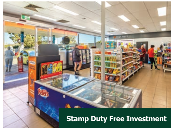
Stamp Duty Free Investment