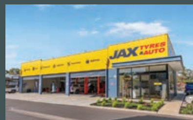
Jax Tyres & Auto Munno Para SA Page 51

The motor vehicle dealership industry is expected to continue its growth trajectory over the next five years, a structural backdrop that supports investor confidence across dealerships, service centres, parts retail, and fuel and convenience assets alike.