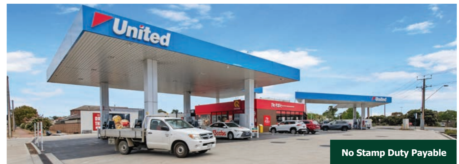
No Stamp Duty Payable