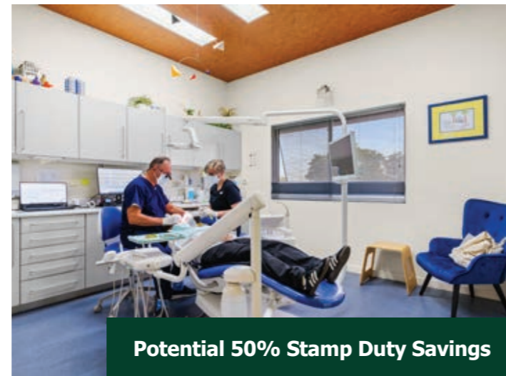
Potential 50% Stamp Duty Savings